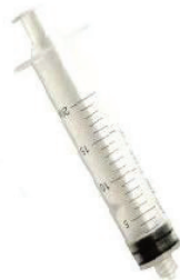
6 cc Luer lock syringe with gel