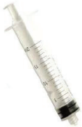
6 cc Luer lock syringe with minocycline