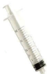
6 cc Luer lock syringe with PEG-PG liquid (1mL)