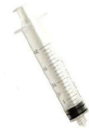
6 cc Luer Lock Syringe with Triple Antibiotic Powder (1g)